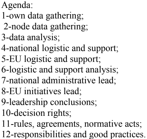
Figure 3 Organization Structure Example Scheme.